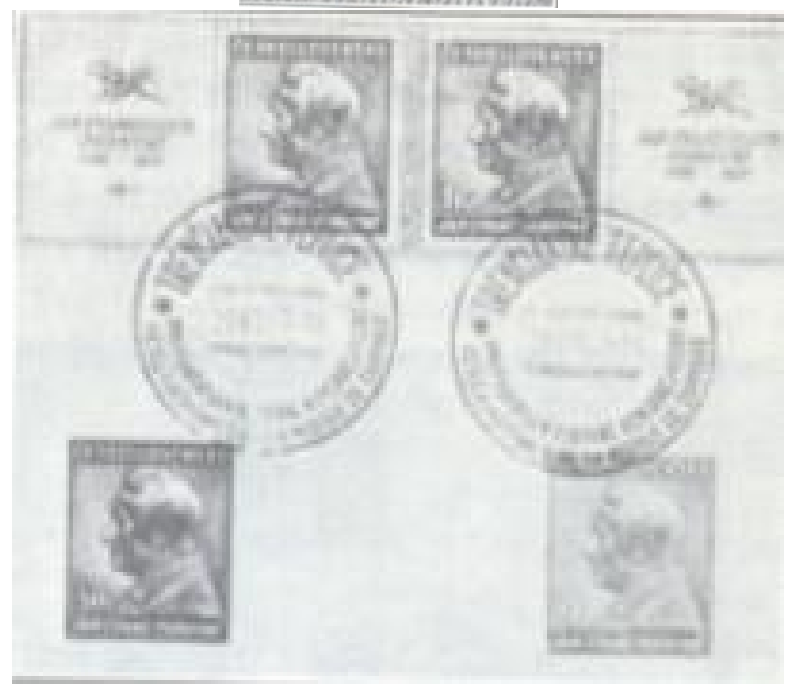
A Purkine post stamp series.